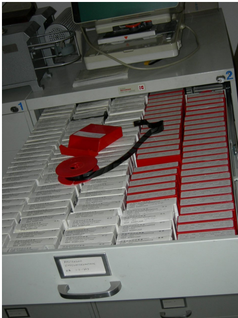
Figure 4. Copies of the films of the Amsterdam City Water Office in the archive of KNMI in De Bilt.