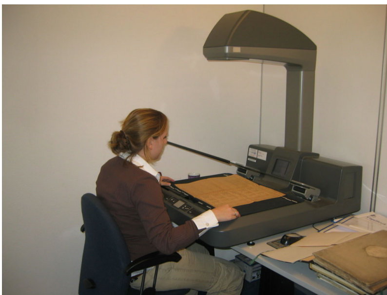
Figure 5. CopiBook bookscanner.