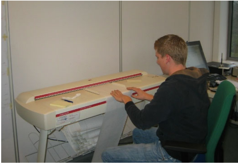
Figure 6. Contex Chameleon G600 large-format scanner.