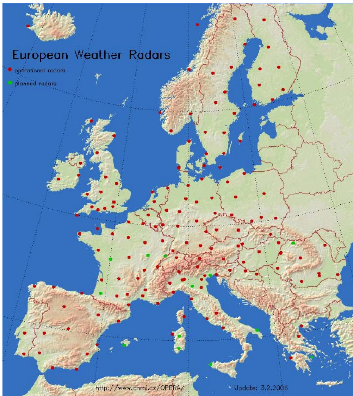
Fig. 1: Weather radars in OPERA and EUMETNET member countries. The map is based on entries stored at the OPERA public data base in January 2007 (from Holleman & Delobbe, 2007).